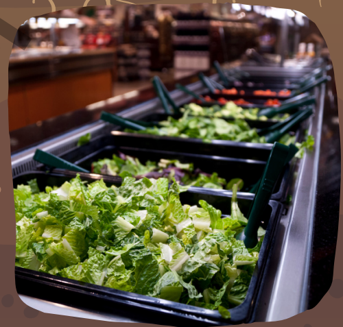
Chopped lettuce on the salad bar