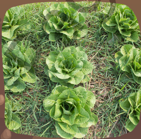
Whole heads of Romaine lettuce

HOW DOES THE LOCAL ITEM WE GET SHOW UP ON YOUR PLATE?